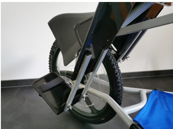
Back view of the maximum enlargement of the footrest

Take care that a longer position can clash with the small 360° turning wheel