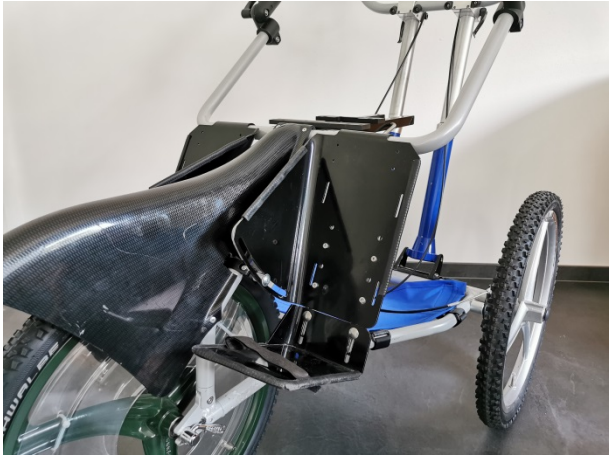
Footrest Vario incl. Enlargement mounted