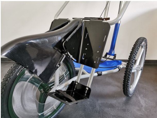
Maximum enlargement by using the standard aluminium profiles

If longer adjustment is requested please order longer aluminium profiles